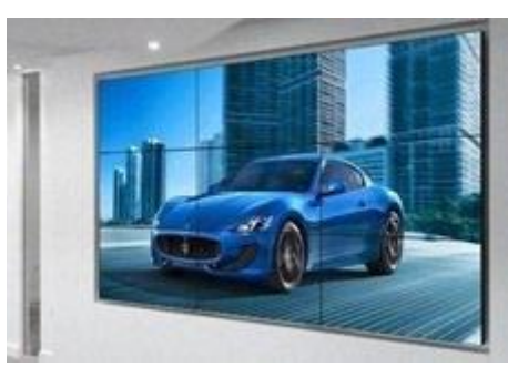
Video Wall Displays