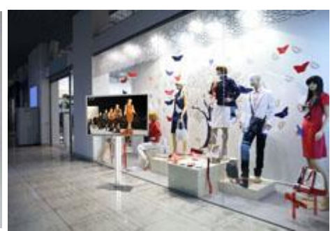
Touch Screen Displays

For full detail of these and all other products available from Hantarex please visit our web site at www.hantarex.com ; complete the enquiry form on the Contact Us page; e-mail: sales@hantarex.com or call Sales on 020 8778 1414