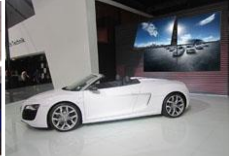
Video Wall Displays